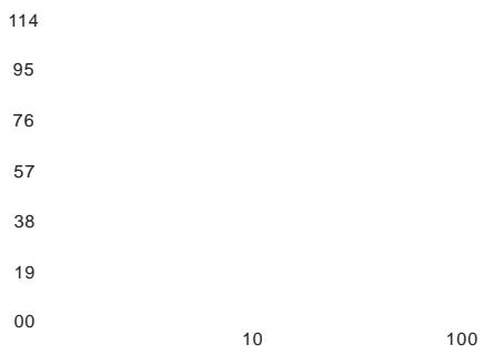
Fig.5 Maximum Non-Repetitive Peak Forward Sk